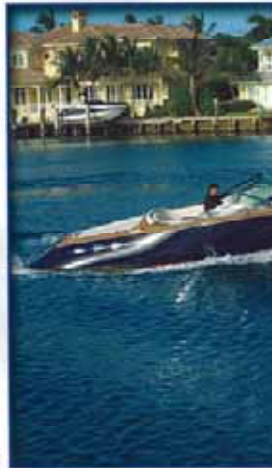
HIGH PERFORM SPORTFISH MEGA YACHT

FEBRUARY 2007 $5,95 US $6,95 CANADA £4,95 UK 025 13