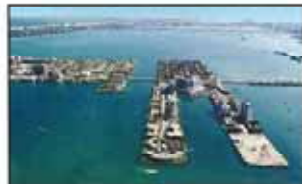
A visionary boater sees convenience as luxury Eloquence on the Bay